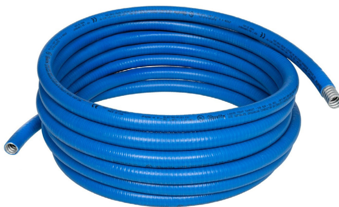
Figure 2. Outside of the U.S., blue jacketing is a big deal in the food-processing industry.

As a result, any plastic contamination that gets introduced into the product stream by damaged jackets is easy to spot, and readily addressable. Blue jacketing also offers resistance to staining and discoloration, and high contrast to elements such as spores, mold and detergent residue — contamination that needs to be spotted and cleaned off. In addition, blue offers a lower reflectivity than standard white jacketing, resulting in less interference with any optoelectronic devices that may be incorporated into the plant production line.