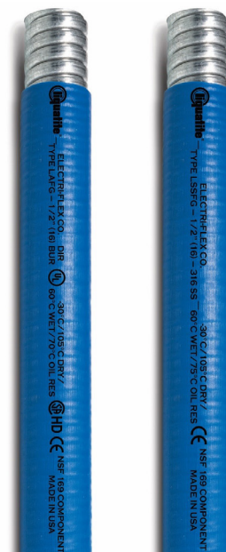
Figure 4. The antimicrobial additive used in the new Electri-Flex lines has shown the ability not only to inhibit their growth, but also to reduce the presence of microbes over a 24-hour period.

According to the World Health Organization (WHO), an estimated 600 million people fall ill each year after eating food contaminated with various microbes, parasites or chemical substances; that translates to nearly 1 in 10 people globally. Factoring in 420,000 deaths, the WHO calculates an annual loss of 33 million disability-adjusted life years (DALYs). In the U.S. alone, according to the U.S. Department of Agriculture (USDA), there are about 48 million annual episodes of foodborne illness, and 3,000 deaths; the most common foodborne pathogens cause an estimated economic burden of $14 billion to $36 billion each year. These numbers underscore the fact that safety in the food-processing industry is critically important not only for localized concerns such as operational efficiency and customer relations, but for big-picture economic and ethical reasons as well.