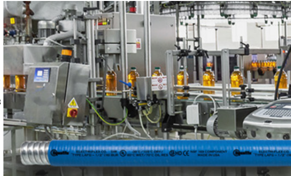
Figure 1. Modern industrial food processing involves miles of electrical wiring, which must be safely routed within flexible conduit raceways.

Ask a design engineer in the food and beverage industry about his or her greatest on-the-job challenges, and the answer will almost certainly include the need to work around stringent health and safety guidelines to prevent contamination. Any points of weakness along the production line must be eliminated not only for the sake of maximizing operational efficiency, but also for protecting consumer health and safety.